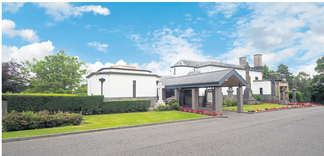
Paisley Woodside Cemetery and Crematorium has had an impressive renovation, completed earlier this month

By 1996, all 20 acres of the memorial park were already utilised and the site was now seeing over 1700 burials and cremation